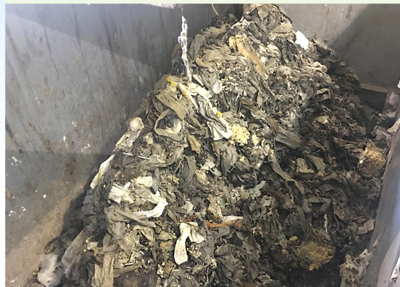
Used “flushable” wipes and other items removed from a sewer in Clinton Township by the Macomb County Public Works Office.